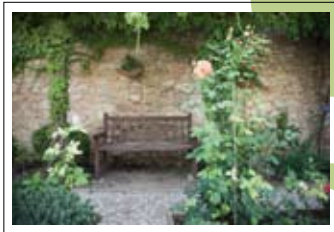
Inviting tree-lined boulevards, covered paseos, dazzling water features and bold architectural elements will combine to create a destination unlike any other.