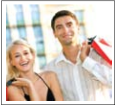
This premier retail and residential setting has been designed to meet the immediate and future needs of the community and surrounding areas.