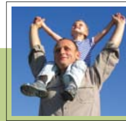
Young families and active retirees are finding a high quality of life in the community, one that offers an alternative lifestyle to the overcrowded Orange and Los Angeles Counties