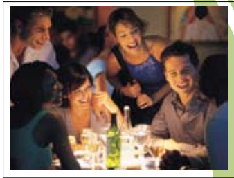
A grouping of prominent restaurants will be front and center along Florida Avenue.