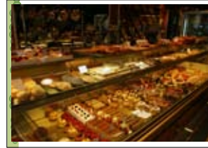
A dramatic departure from the traditional shopping center, Garrett Ranch will be a pedestrian-friendly development comprised of unique themed retail, dining and entertainment districts.