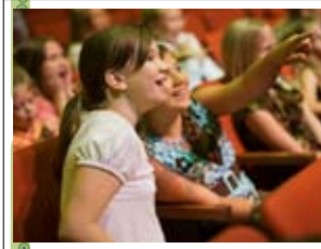
A state-of-the-art, multi-plex cinema will be located at the north end of the boulevard.